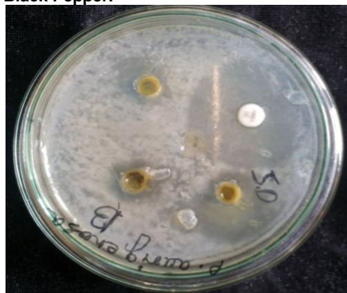
Figure 1: Inhibition Zone Photographs of Pseudomonas Aeruginosa for Benzene Extract of Black Pepper.